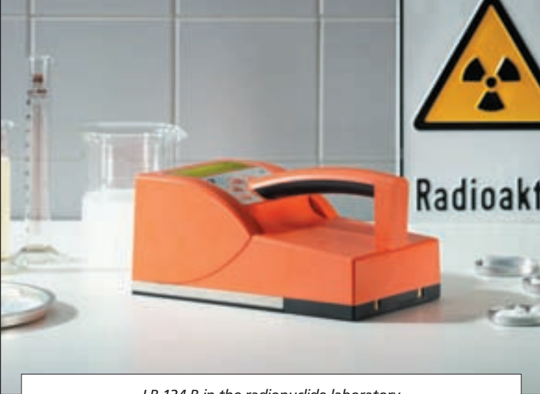
LB 124 B in the radionuclide laboratory