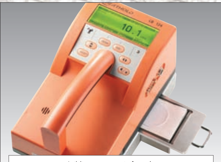
Activity measurement of samples